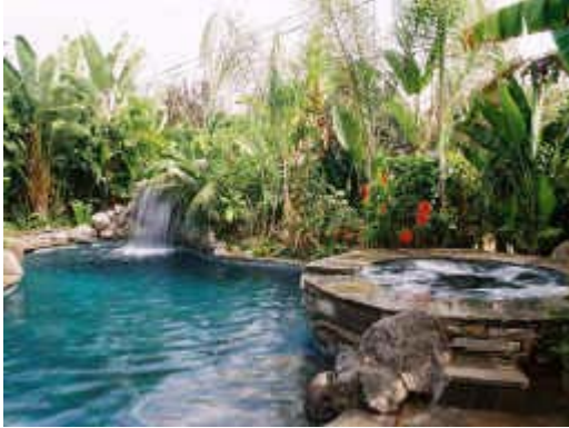
Click for larger pictures.

599 Nile Street, Clairemont, 92117 - Price $989,000 This 1 Story , 2 bedroom, 1 bath home was built in 1942.